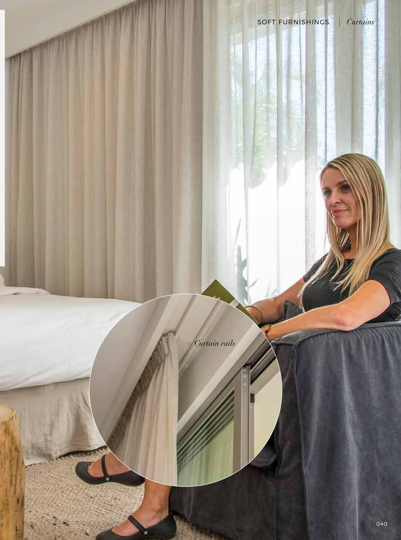
< Curtain rails

Aesthetics aside, soft furnishings are a great way to give each room a welcoming feel and provide a setting that is comfortable and luxurious. An interior featuring beautiful drape fabric balanced by scatter cushions, upholstered chairs or ottomans creates the effect of optimum comfort and style and the feeling of a uniquely personal home. \\